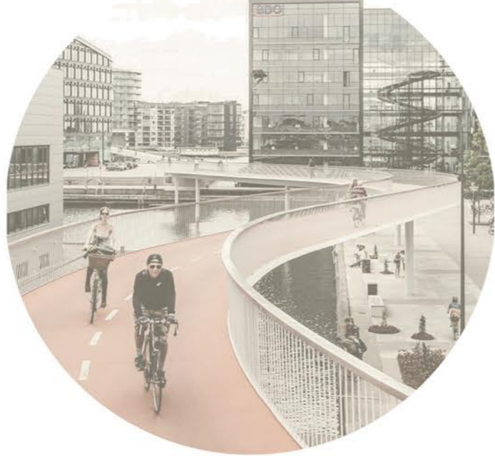
Cykelslangen, Dissing+Weitling Arch. Copenhagen, Denmark