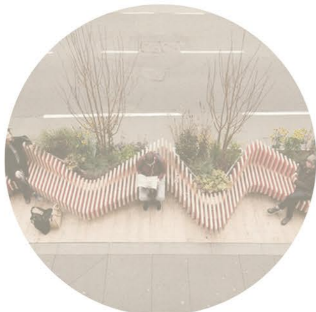
bench, wmb studio