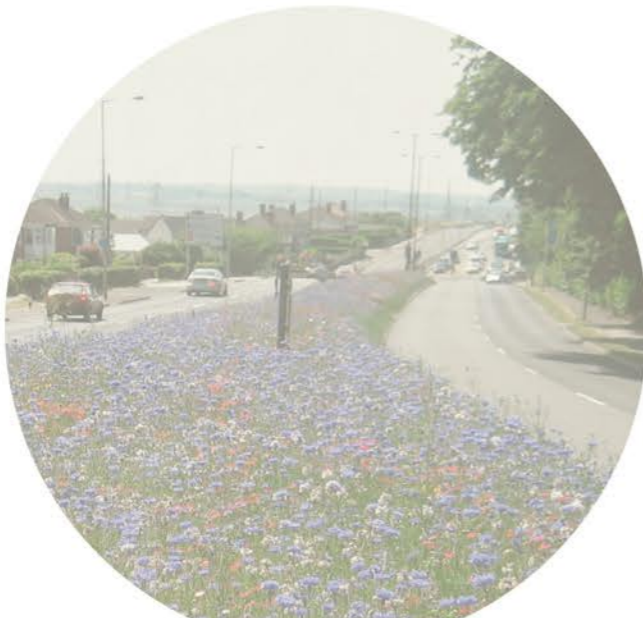
A630 Highway Rotterdam Netherland