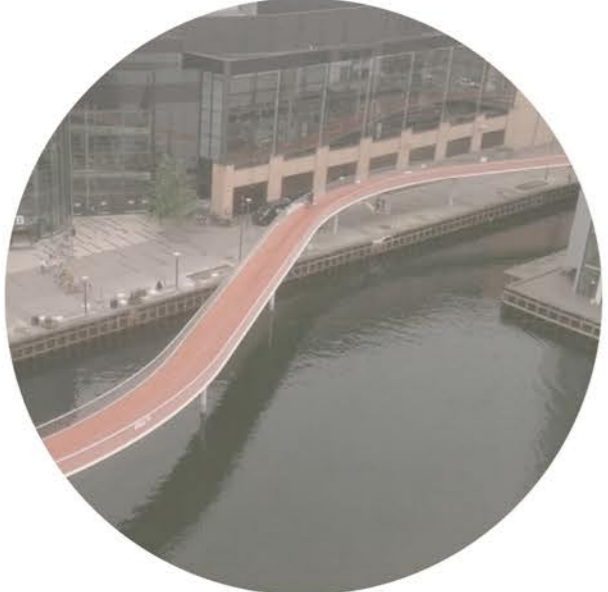
Cykelslangen, Dissing+Weitling Arch. Copenhagen, Denmark