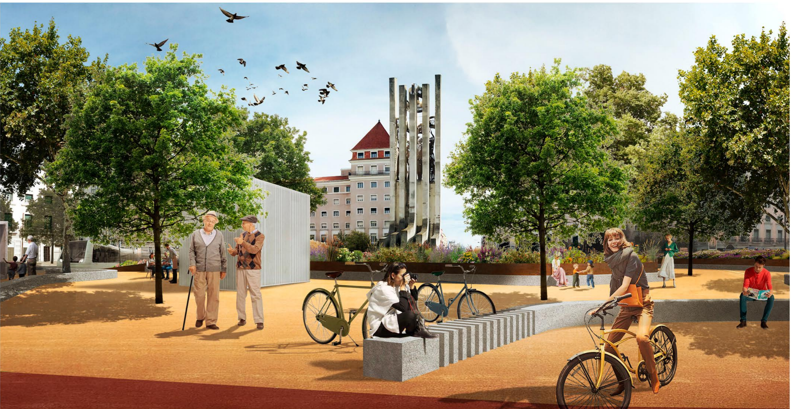
3D VIEW - PRAÇA DO AREIRO