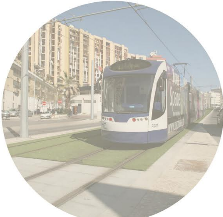
Tram Line Almada, Portugal

The tram and the rehabilitation of the old power lines are among the points that seem most important to us in our proposal. Being electric and not dependent on fossil fuels is one of the ways, being the most shown at the moment of mobility in the city, being the traditional moment of mobility in the city, present as one of the forms of transport of the future. intermodal zone that then allows the entry into a new modern tramway.