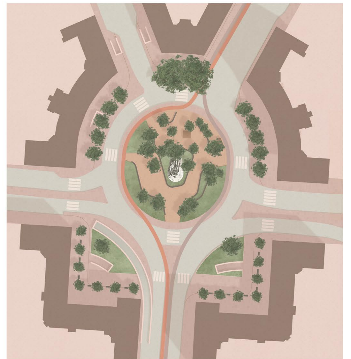
PLAN - PRAÇA DO AREIRO - 1:1.500