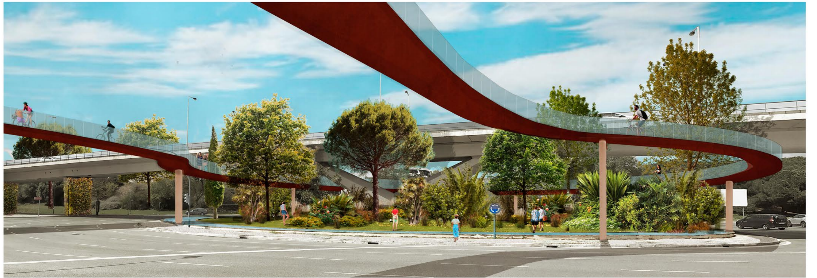
3D VIEW - ROTUNDA DO RELÓGIO