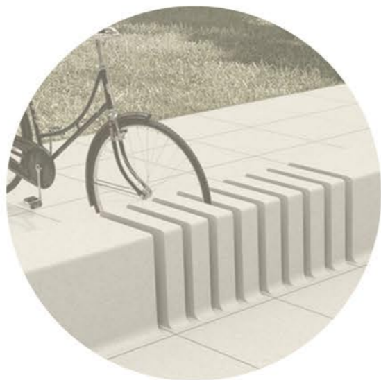
byke park, yanko design

The tram and the rehabilitation of the old power lines are among the points that seem most important to us in our proposal. Being electric and not dependent on fossil fuels is one of the ways, being the most shown at the moment of mobility in the city, being the traditional moment of mobility in the city, present as one of the forms of transport of the future. intermodal zone that then allows the entry into a new modern tramway.