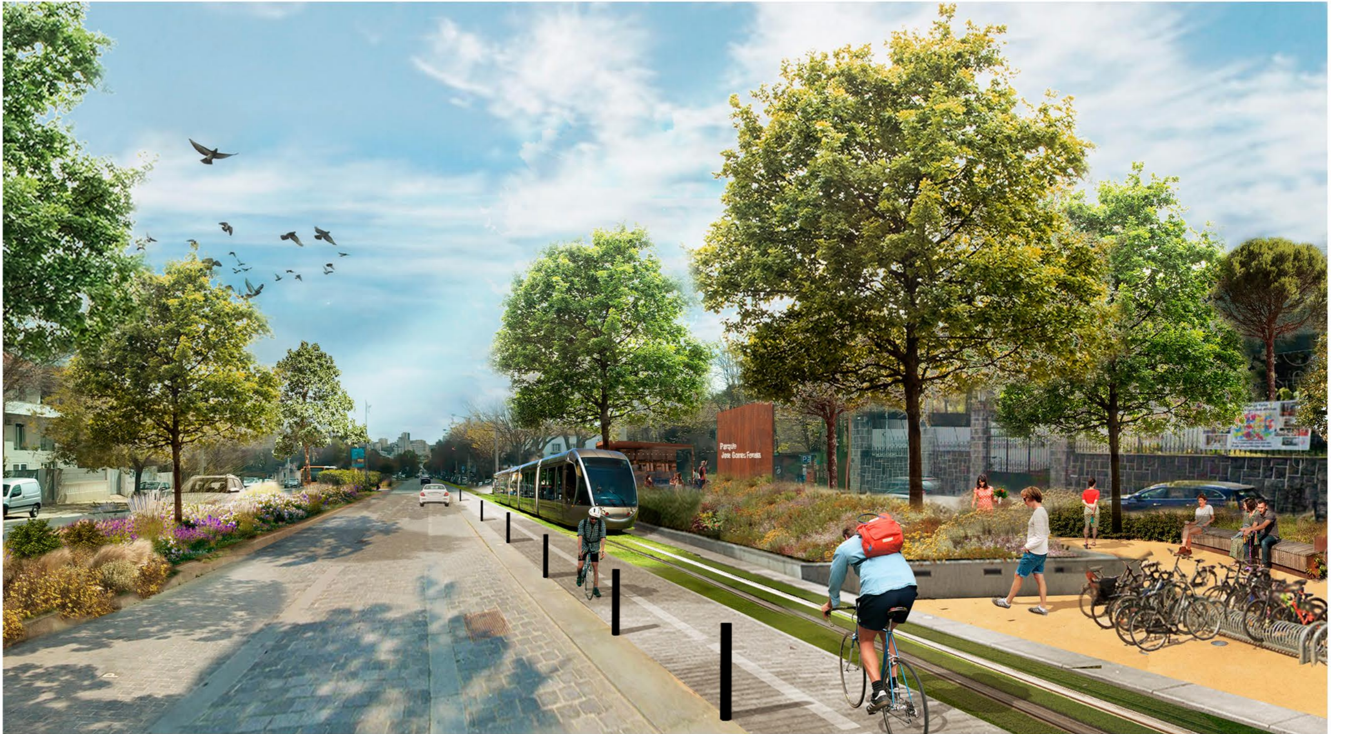
3D VIEW - GAGO COUTINHO - PARQUE JOSÉ GOMES FERREIRA ENTRANCE